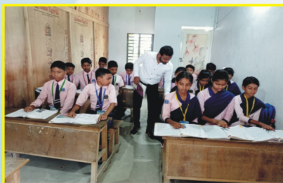
Busy in Learning in small class under Mature Guidance of the Teacher