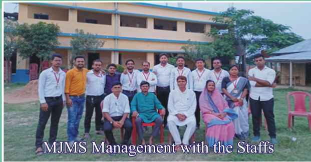
MJMS Management with the Staffs