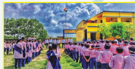
Observation of Independence Day at MJMS

We carefully nurture the diversified latent talents among the budding human resources. Every year Govt. declared celebration days as well as some locally significant occasions /cultures or memoirs are observed. Drawing, sports, essay writing, recitation etc. competitive events are also being observed. In addition to these, one special cultural event under the title of "BIHAN" is being observed in this school in order to give way the nurturance and manifestation of the diversified cultural talents among our students and the teachers.