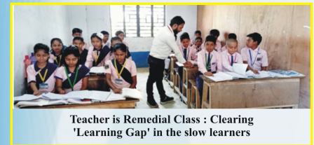
Teacher is Remedial Class : Clearing 'Learning Gap' in the slow learners