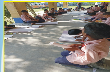
Drawing Competition at MJMS