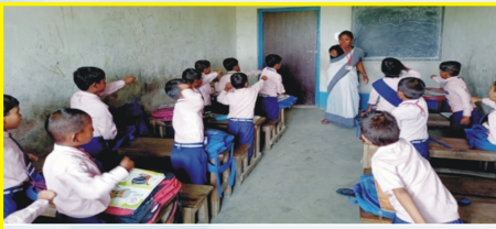
Learning is a Joy at MJMS

The school was started with 43 students, 19 in K.G. and 24 in Nursery on 2 nd January, 2016. MJMS experienced a ZERO DROPOUT RATE in its very year of establishment. This is miraculous and very much encouraging record which M. J. MEMORIAL SCHOOL achieved in the history of education. In the subsequent years also the dropout rate was negligibly low. But expectedly, we had to feel the burn of a sharp 31% dropout due to COVID-19 pandemic in 2020-21 academic year! However, the situation has improved now. This year students' intake has gone up by 30.62% compared to the last year's strength.