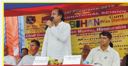
Local Dignitaries and People's Representatives with the School Management