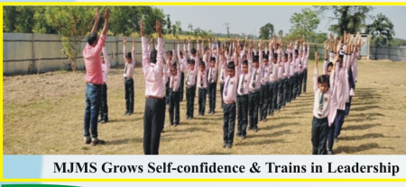
MJMS Grows Self-confidence & Trains in Leadership