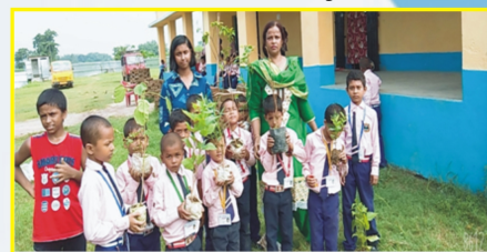
Social Responsibility: Learning by Doing - MJMS imparts TRUE EDUCATION

School is a miniature Society. Good schoolsociety collaboration is essential for an educational institution to discharge its duties properly. In view of this MJMS organizes different types of interactive programmes throughout the year with the enlightened, conscious members of the society. We are proud to announce that MJMS enjoys a healthy schoolsociety collaboration, which, we hope, will prove immensely helpful in achieving the set high aim of this mission in materializing a true Educational Revolution in this backward region.