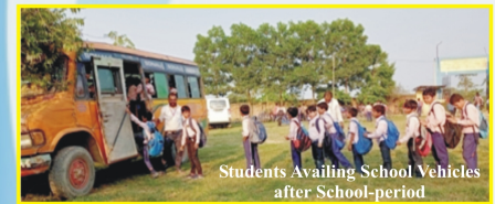
Students Availing School Vehicles after School-period

The school has vehicle services to ferry students from far from locality to school and back at optimized rate.