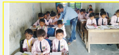
Individualized Teaching by the Teacher : Keeps them Up-bright

The school was started with only two classes NURSERY & K.G. (Kindergarten) and upgrades one class every year. At the start of the academic year 2020-21, the school had enrolment of total 232 students in total six classes NURSERY, K.G. CLASSES I to IV in 9 sections altogether. But due to the COVID-19 Pandemic for about two years, we along with other rural schools faced a huge dropout. Although, we were the first in West Bengal to start online teaching-learning process from 14 th April, 2020, but failed to overcome the much accelerated barriers to education the poverty and negative attitudinal barriers. But it is our positive inner strength that we successfully overcame the darkest phase in education the COVID-19's evil shadow. In 2021-22 session Class V was the highest class with total students' strength of 160. In the post pandemic sessions, 2022-23 the highest upgraded Class now is VI with total 209 students. In the coming session (2023-24) the highest class will be Class VII starting from Nursery. Direct admission will be done only in Nursery and K.G. classes. However, few students may be admitted in upper classes (up to VII) through Admission Test.