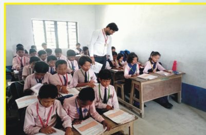
MJMS Students in Interactive Learning with the Teacher : Clears Concepts