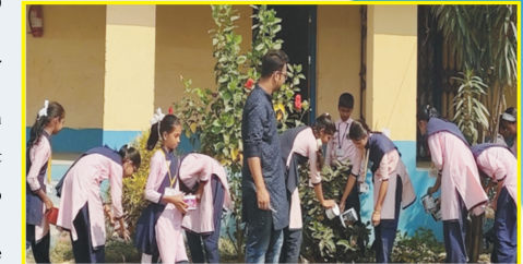
School Environment Friendship Correlation : Trains MJMS

curricular activities in order to gather experiences as building block of their complete human personality.