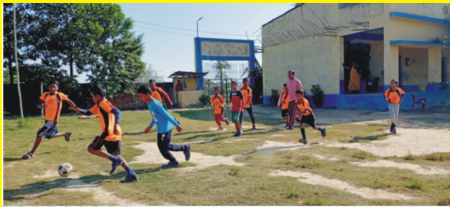
Teacher as "Friend, Philosopher and Guide" : Hostel Students with their Teachers in Sporty Mood