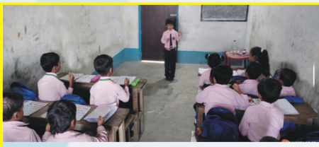
MJMS Trains in Self-discipline