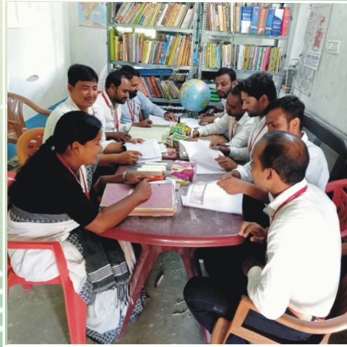
MJMS Teachers The True Human Resource : Truly Build Your Children's Future