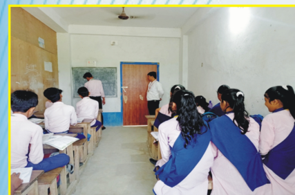
MJMS inculcates Self-study under Teacher's Guidance, the best study habit