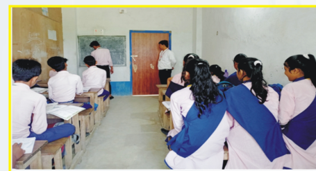
MJMS Students in Class Room Assignment : Develops Problem Solving Skill

In order to provide the best quality of education teacher's individual attention to each learner is a must. In order to ensure it, Teacher : Students ratio is maintained at 1:24 in the classroom i.e., one teacher is devoted to only about 24 students in a class room/section. At present, the overall Teacher: Student ration is far better, 1.00 : 23.22.