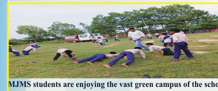
MJMS students are enjoying the vast green campus of the school