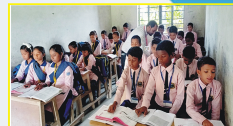
MJMS Students in Class Room Assignment : Develops Problem Solving Skill